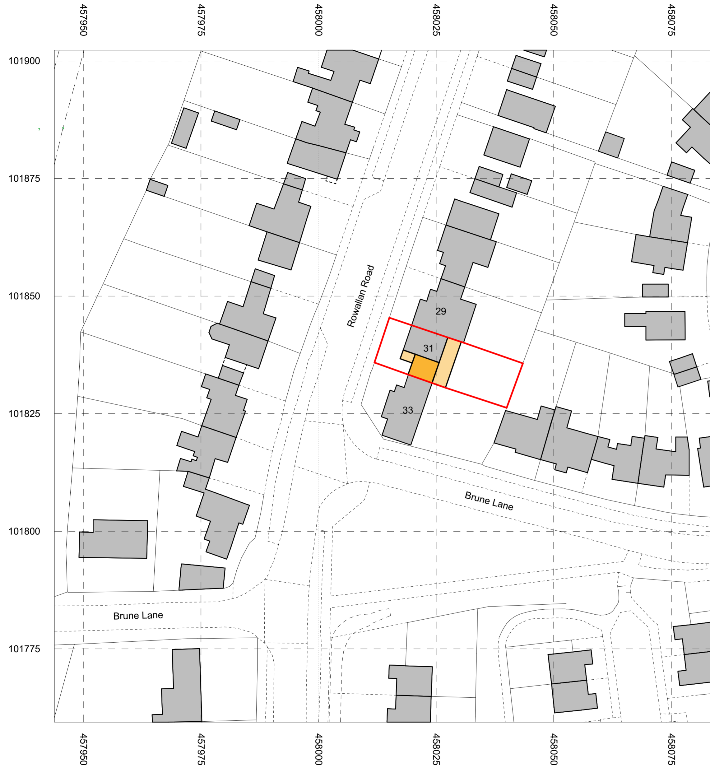
OS Map - Proposed