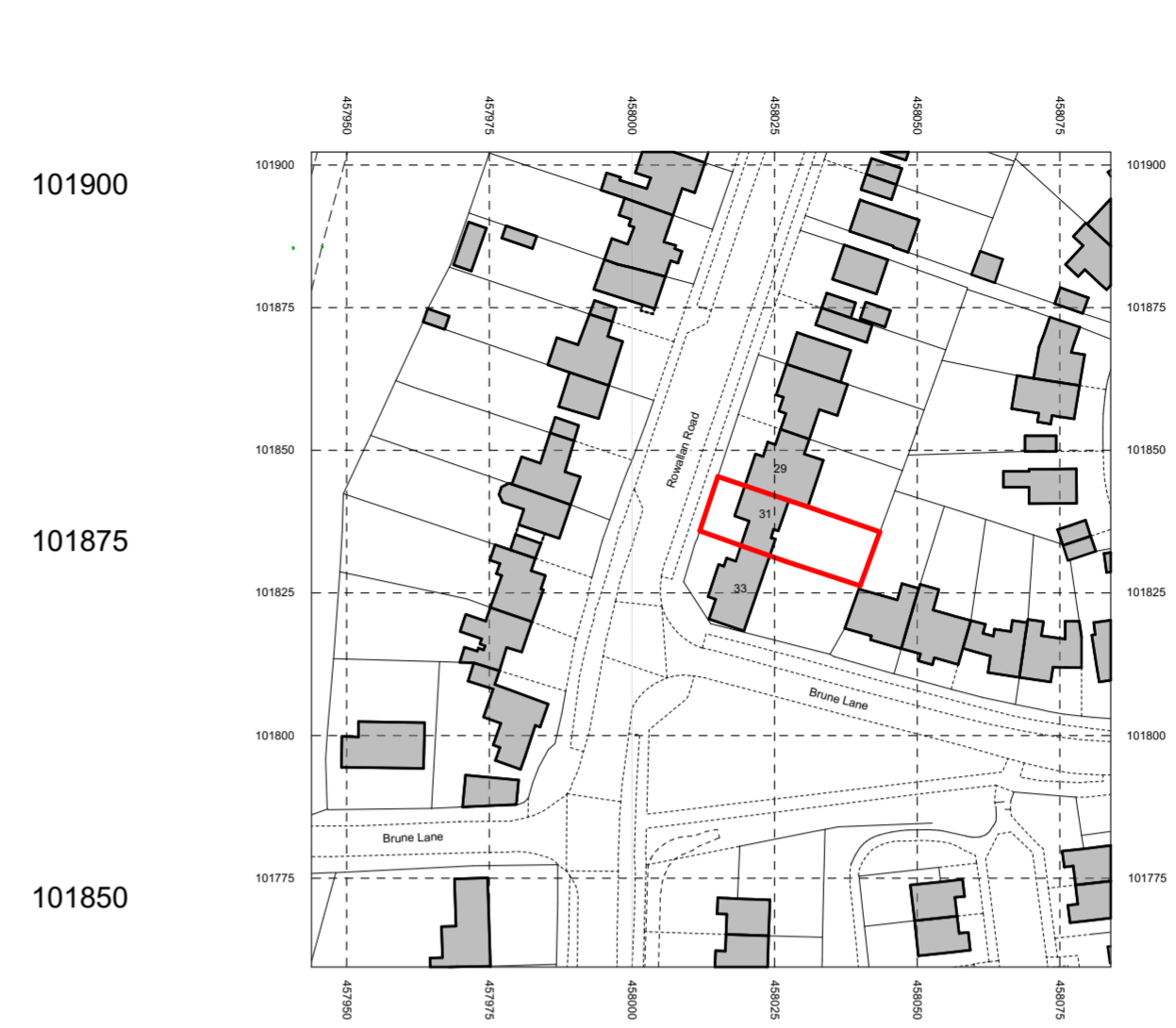
OS Map - Existing