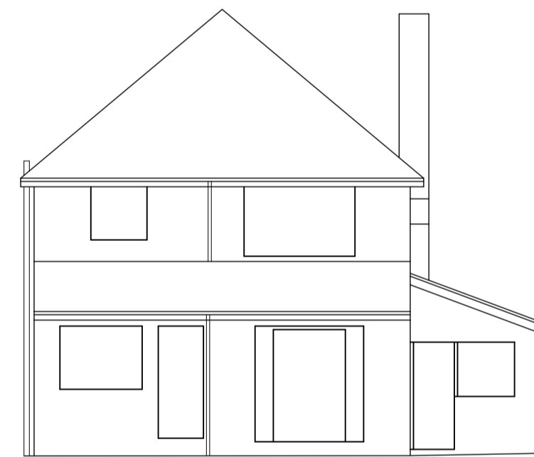
3.0m DATUM NORTH ELEVATION